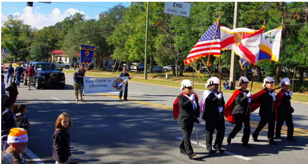
Knights of Columbus at the Niceville Christmas Parade